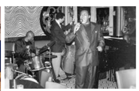
...at Harlem's famous Lenox Lounge...