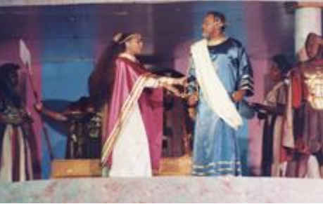
...as Pontius Pilate in the Passion Play...