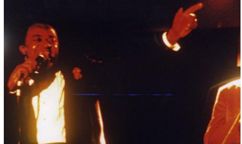
...at the Blue Note tribute to Billy Eckstein...