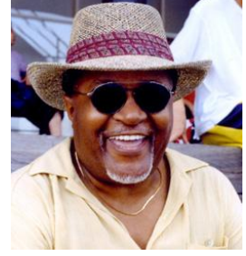
To all the gifted young artists, to old friends and new...may God grant me His grace to sing my songs for you.