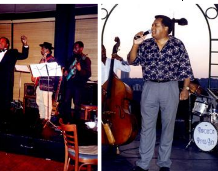
...at Jazz on the Hudson...