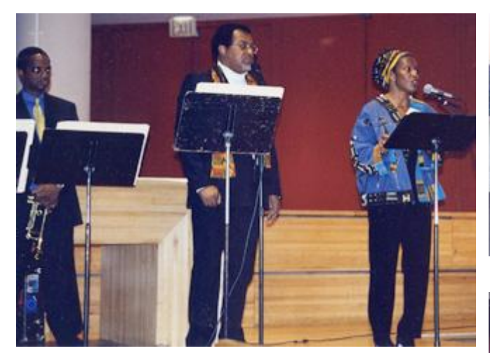
...my original work, Jazzstoria, at St. Peters Church...