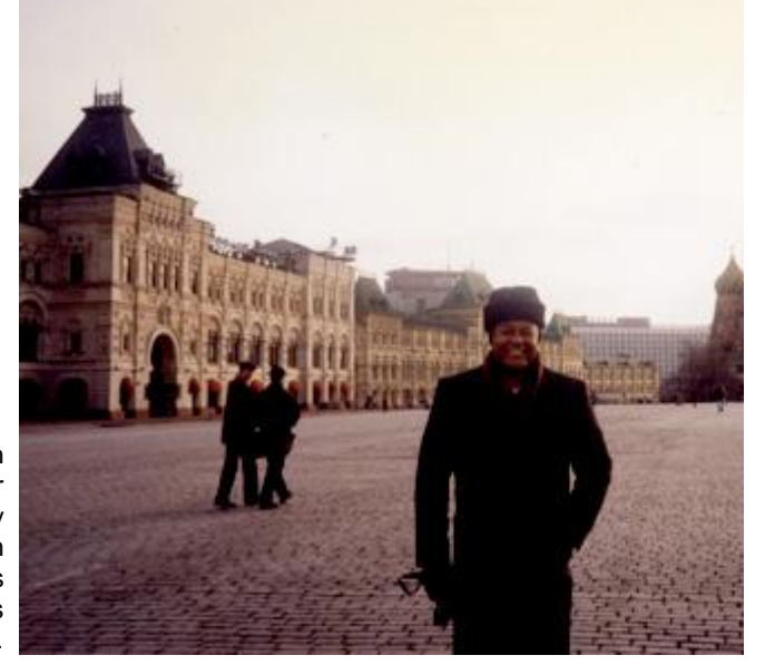
And even when I walk through the park or ride in the cars or stroll by the light of the silvery stars, music echoes from my past to now, brightens my days...and illumines my ways...